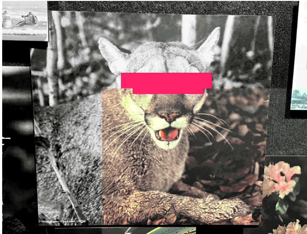
Animated GIF by Isabel Gray